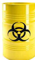
Laboratory Waste Can 20 Liters capacity