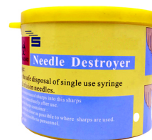
Needle Destroyer with Cutter